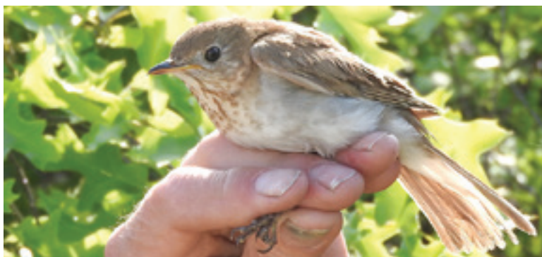
Veeries are small, brown thrushes whose flute-like, downward spiraling song is often heard in damp forests of the Northwoods.

You can discover more about Emily Stone through Natural Connections online at cablemuseumnaturalconnections.blogspot.com . For more than 50 years, the Cable Natural History Museum has served to connect you to the Northwoods. Connect on Facebook, Instagram, YouTube, and cablemuseum.org to keep track of our latest adventures in learning.